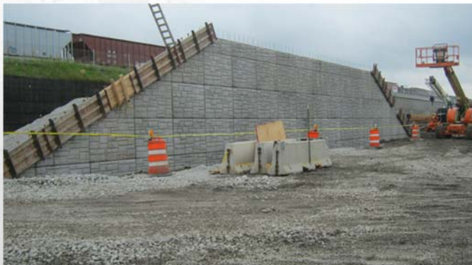
Construction of retaining wall