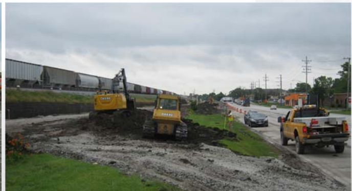
Excavation for construction of swale to Bensenville Creek