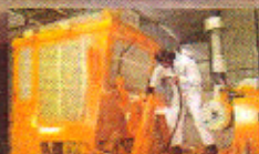
J.E.R. OVERHAUL INC. A Nordco Company Arcola, Illinois