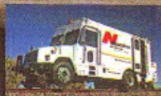
Nordco Rail Services Lee's Summit, Missouri