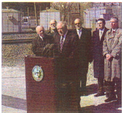
Illinois Gov. Pat Quinn with dignitaries at ceremonies at the site of the Englewood Flyover on Chicago's south side.

In February, U.S. DOT announced that the CREATE Program would receive $100 million in TIGER funds under the ARRA to complete five projects. Work on the first of those five projects began in July. The Broadview/LaGrange