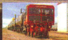
SHUTTLEWAGON MOBILE RAILCAR MOVERS A Nordco Company Grandview, Missouri