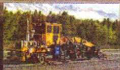
Nordco Inc. Oak Creek, Wisconsin • Oshawa, Ontario

Dapco A Nordco Company Ridgfield, Connecticut