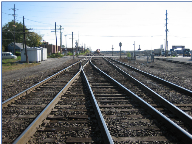
Before grade separation, looking west