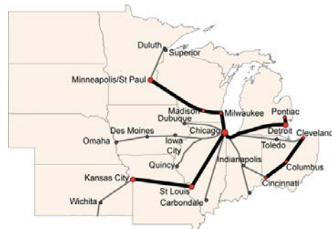
Figure 2.2 Midwest High-Speed Rail Hub

The Chicago Hub shown in Figure 2.2 is one of 10 high-speed rail corridors designated by the Federal Railroad Administration. Using grants from the American Recovery and Reinvestment Act (ARRA), improvements to this corridor will be made that allow passenger rail service from Chicago to St. Louis to operate at speeds of up to 110 mph. Three of the CREATE projects in this application are on freight tracks that cross the Chicago to St. Louis passenger route and one is on the route to Indianapolis, providing benefits to intercity passenger trains that frequently face delays due to freight conflict.