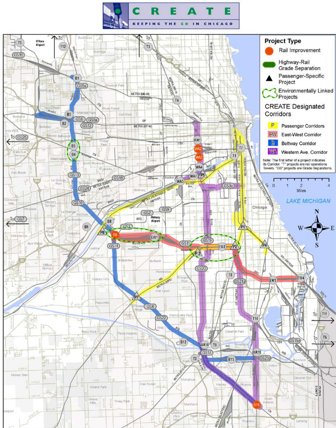
Figure 2.1 CREATE Projects Targeted for TIGER IV Funding

Note: Does not include Viaduct Improvement Program locations, Safety Improvement Program or Common Operational Picture