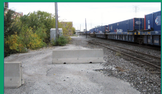
Location of future upgrades